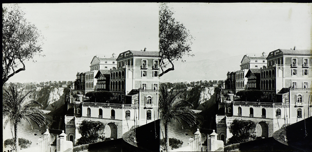
Sorrento a Napoli.