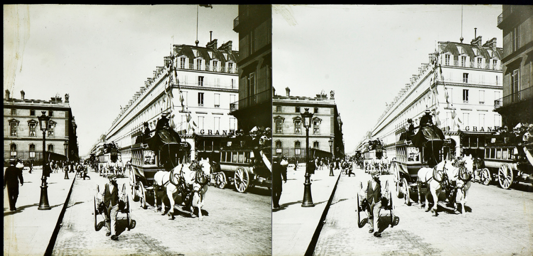
Paris me Rivoli.